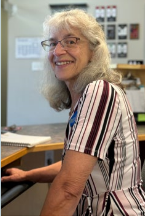
Beacon Volunteer at SHOAL Centre Reception