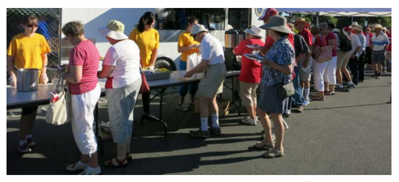
YEP volunteers helping serve during Canada Day Lions Pancake Breakfast in Sidney.