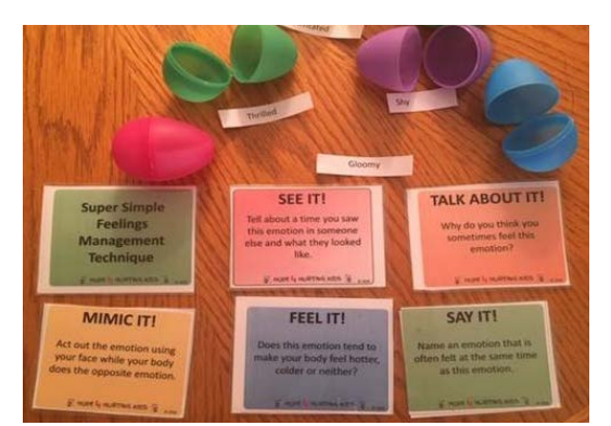
The Eggcellent Emotions Relay activity in the Wellness & Melprogram.

Participants enjoy exciting learning activities that encourage self-awareness, positive relationship-building, self-reflection and group discussion. Topics include: self-esteem, personal boundaries, friendship and healthy relationships, personal safety, emotional intelligence, problem solving, and managing stress, anxiety, and negative thinking.